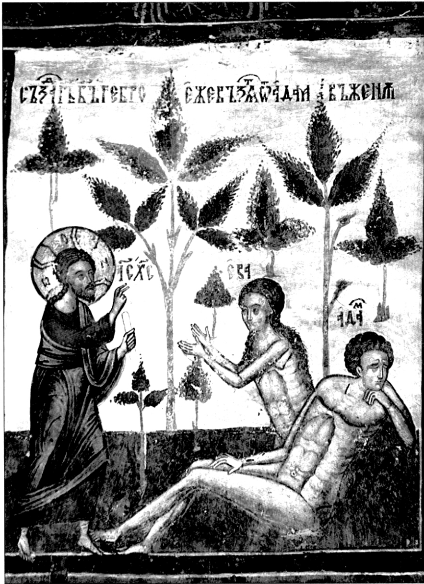
The creation of Eve from the rib of Adam. Fresco from the Church of the Resurrection, Suchevisța Monastery, Moldavia, Romania, sixteenth century.